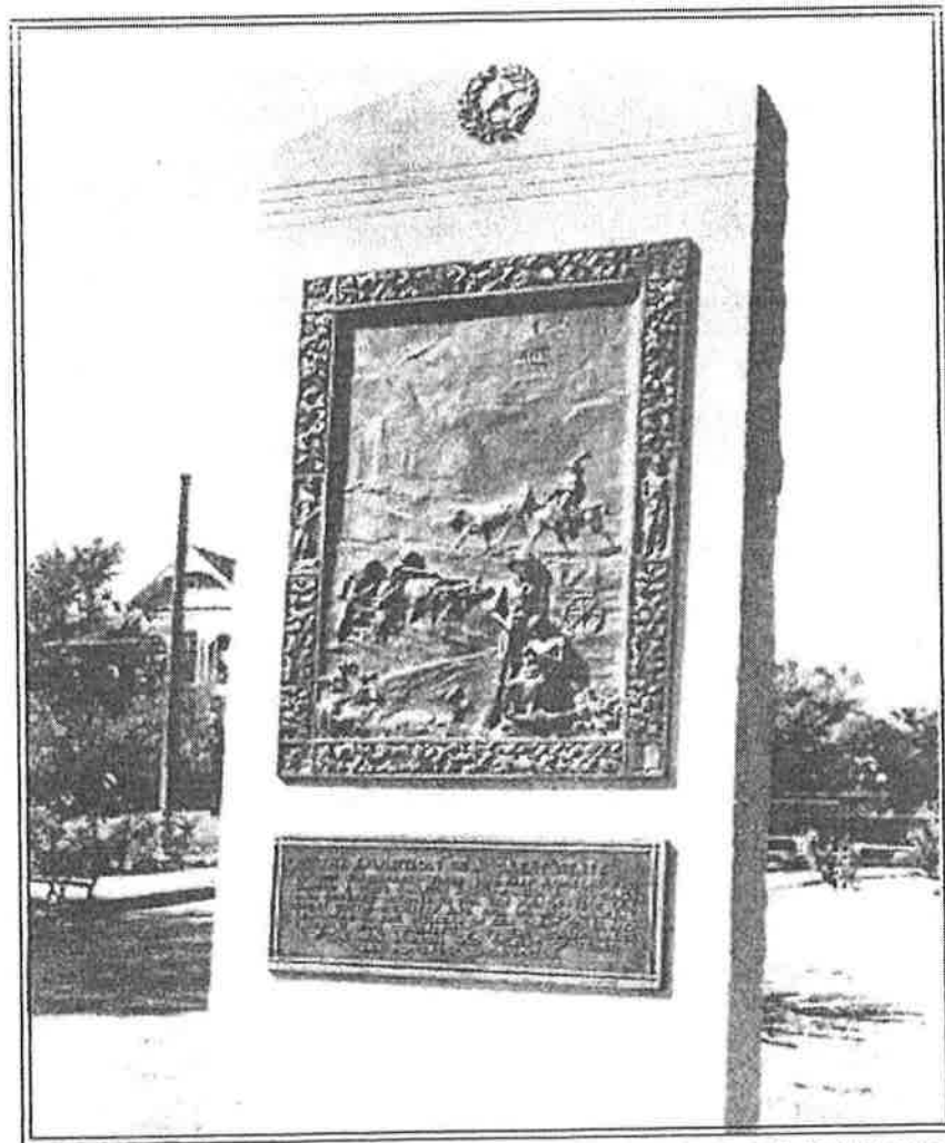
TEXAS HISTORICAL RECORD MONUMENT STATE CAPITOL, AUSTIN, TEXAS Twelfth Street Esplanade