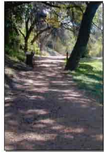
EXAMPLE OF A HIKE-AND-BIKE TRAIL

Golf courses, linear parks/greenbelts, trails, country clubs, school parks, botanical gardens and special athletic and community centers, including youth centers (e.g., YMCA) and civic centers, are considered to be special types of recreational facilities. Standards for this type of facility are variable and dependent upon the extent of services provided by the special facility. Sachse currently does not have any special use parks.