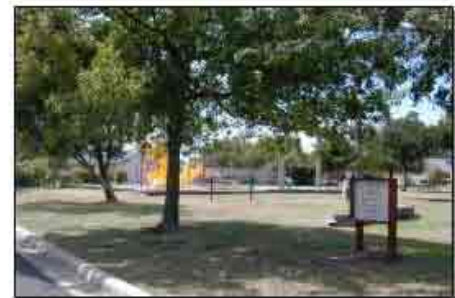
EXAMPLE OF A MINI-PARK

A mini-park/pocket park is a small area generally used as a children's playground or as a passive or aesthetic area. Mini-parks/pocket parks are designed to serve a very small population area and are often privately owned or maintained by a property association. These parks normally serve a population base of 500 to 1,000 persons, and although they range in size, they are typically less than 5 acres. The primary function and use of this