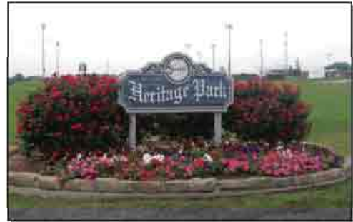
HERITAGE PARK, A COMMUNITY PARK IN SACHSE

A community park is larger than a neighborhood park, and is oriented toward providing active recreational facilities for all ages. Community parks serve several neighborhood areas or an entire city, and therefore, they should be conveniently accessible by automobile, and should include provisions for off-street parking. Activities provided in these parks generally include: